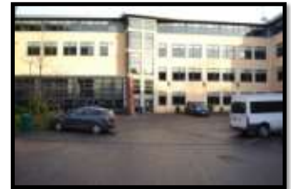
St Thomas of Aquins School, Back Entrance