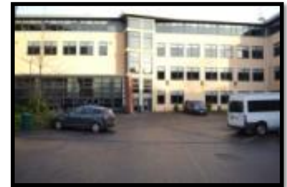
St Thomas of Aquins School, Back Entrance